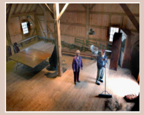
above: The goal is to finish the Barn before the Auction!