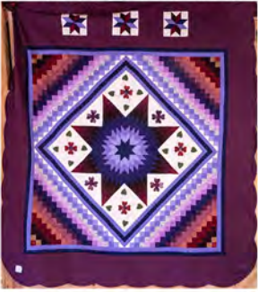
Trip Around the Star 109" x 118" Queen

A collection of hand-made quilts. Sold at 11:00 AM