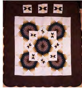
Starburst 109" x 115" Queen

More quilts will be added to the inventory.