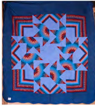
Falling Star 108" x 116" Queen