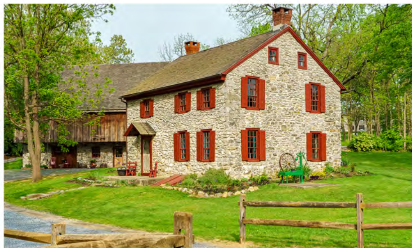
2022, now a vibrant homestead and grounds open for public tours and events.