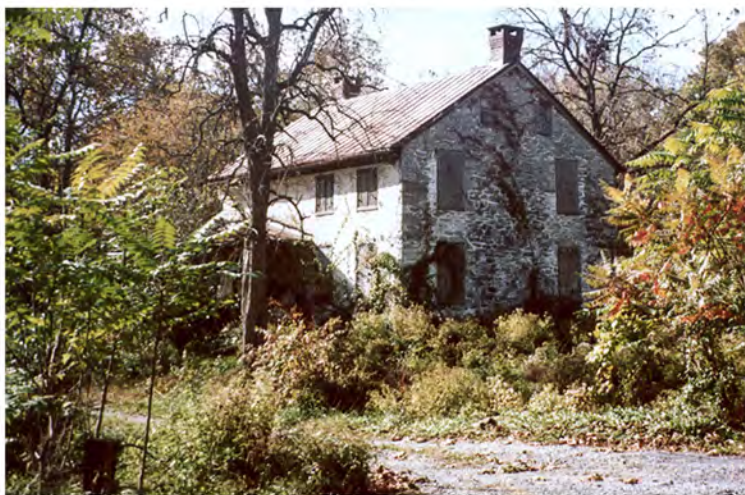
Late 1990s, scheduled to be demolished

As caretakers of the homestead, we are tasked with preservation of what has been started as well as continuing the old house restoration. Two rooms of the house haven't been restored and the old crumbling plaster is a stark contrast to the beautifully finished rooms. If you are interested in volunteering time or money for this project, you may contact us (Elam and Esther Stoltzfus) at the Homestead or reach out to one of our committee members. Our goal and vision is to provide a place of sanctuary and connection with past and present, and a place of beauty for our generation and future generations to enjoy.