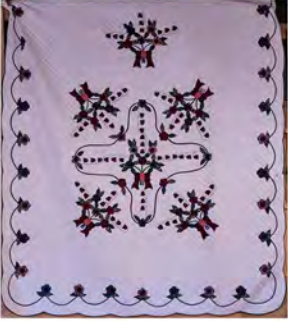
Lily of the Valley 104" x 114" Queen