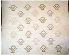
Hand quilted Flower Basket - vintage, at least 40 years, never used. 80" x 80"