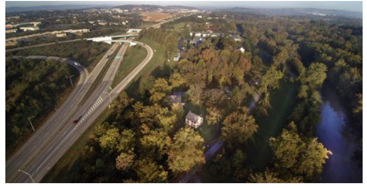
Aerial view of the Nicholas Stoltzfus Homestead.