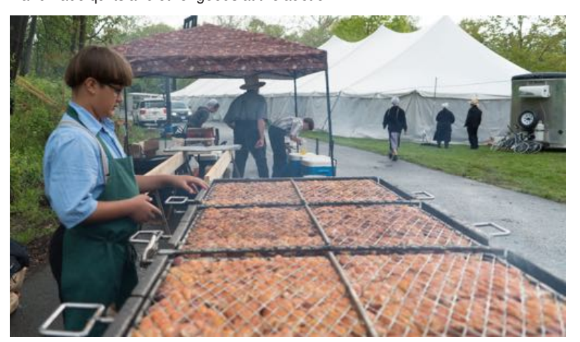
Plenty of fresh food and homemade goodies.