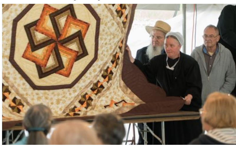
Handmade quilts and other goods at the auction.